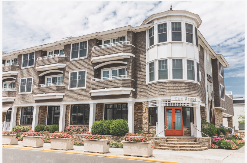
The Reeds at Shelter Haven, Stone Harbor, NJ