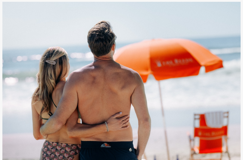
Summer at the Shore at The Reeds at Shelter Haven

Reeds Passport Stamps are available throughout the Resort. Guests collect stamps for making