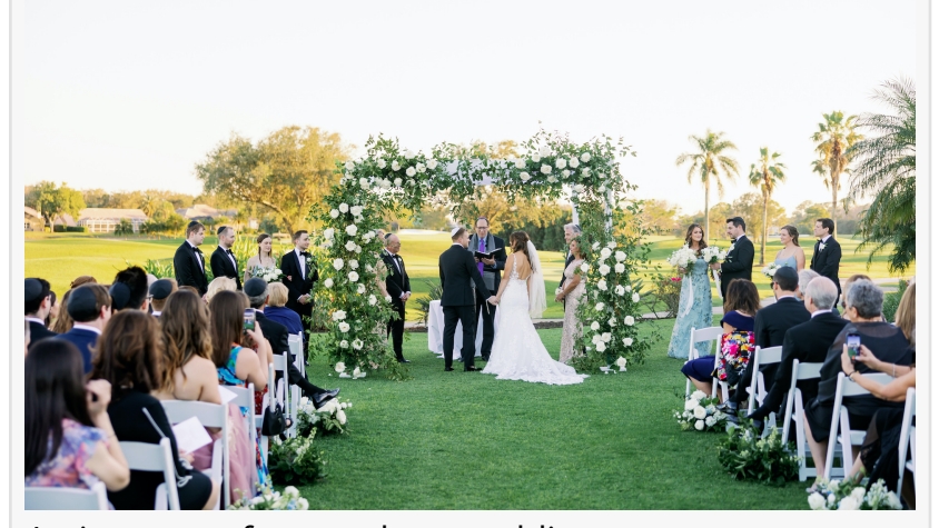
A picture-perfect outdoor wedding ceremony at Naples, Florida's Vineyards Country Club, surrounded by lush landscaping and sweeping golf course views.

A beautifully styled private event at Vineyards Country Club, where lush florals, chandeliers, candlelit tablescapes and elegant greenery create an extraordinary atmosphere.