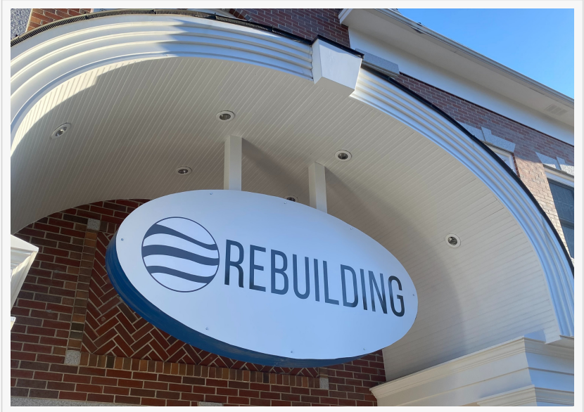
Rebuilding Recovery Center in South Easton, Massachusetts

• Half-Day Treatment Program: Flexible support for those balancing recovery with work, school, or family commitments. This provides intensive therapy in a condensed format.