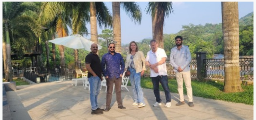
"Crafted Connections: Exploring Innovation with Our Indian Partners"