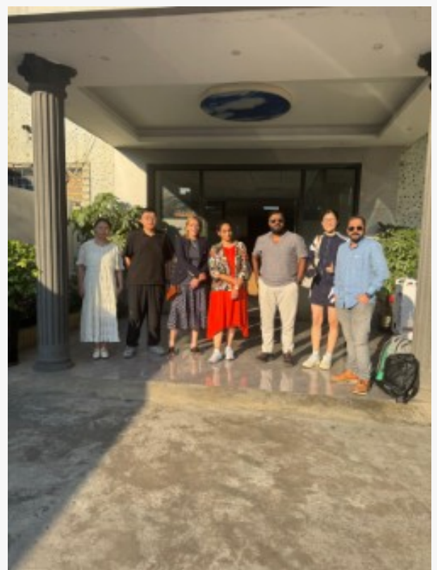
Lighting Partners in Design and Manufacturing

Metropolitan Studio remains deeply committed to supporting domestic craftsmanship. Products are sourced and procured within the United States and internationally to capture global innovations that enhance its distinctive design approach for our client's projects.