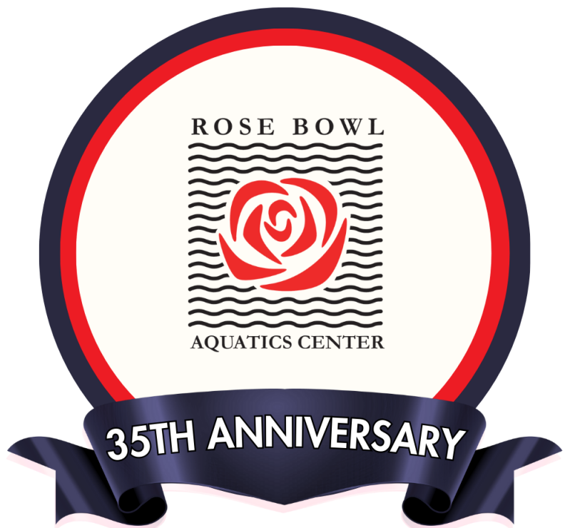
35th anniversary logo