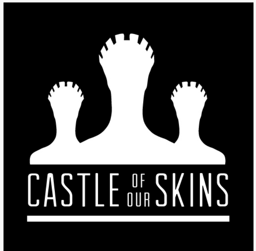
Castle of our Skins logo

□ Sunday, June 8, 2025 | □ 2:15 PM Pre-Event | 3:00 PM Concert