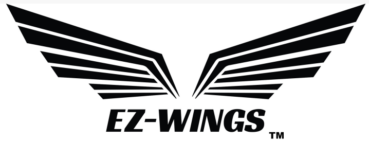
EZ Wings Logo