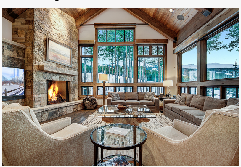
Great Room for Timber Trail Living Room

square feet of expertly designed space over five levels. The home includes eight bedrooms, nine bathrooms, and a full suite of luxury resort-style amenities that cater to the most discerning global buyers.