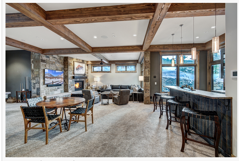
422 Timber Trail Living Space