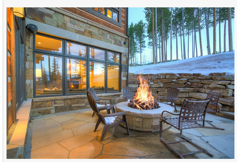
Luxury Fire Pit Off the Slopes

Once known primarily for its charming ski town appeal, Breckenridge is gaining rapid traction as a global destination for high-net-worth individuals, thanks to its unique blend of outdoor adventure, privacy, tax advantages, and elevated luxury offerings. No property better embodies this new frontier than 422 Timber Trail Road.