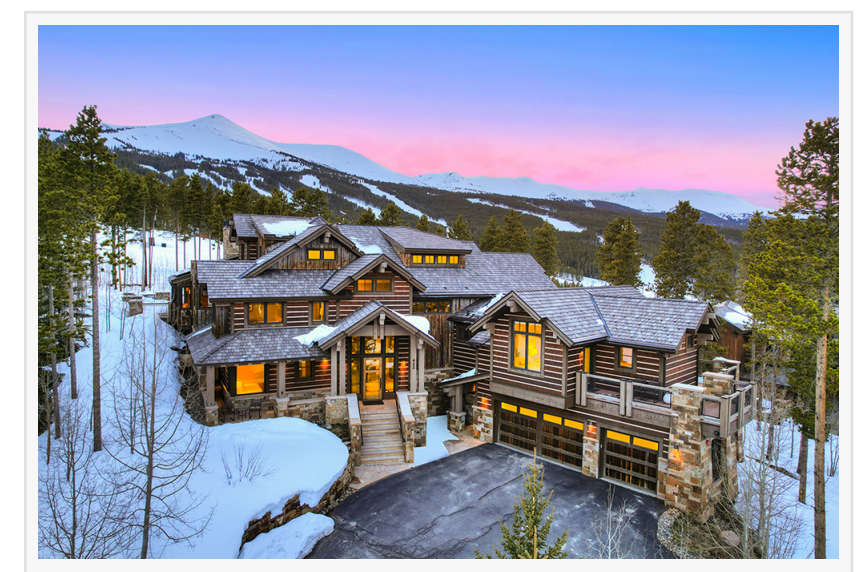
The stunning front of this home

winning Pinnacle Mountain Homes, 422 Timber Trail Road spans 8,072