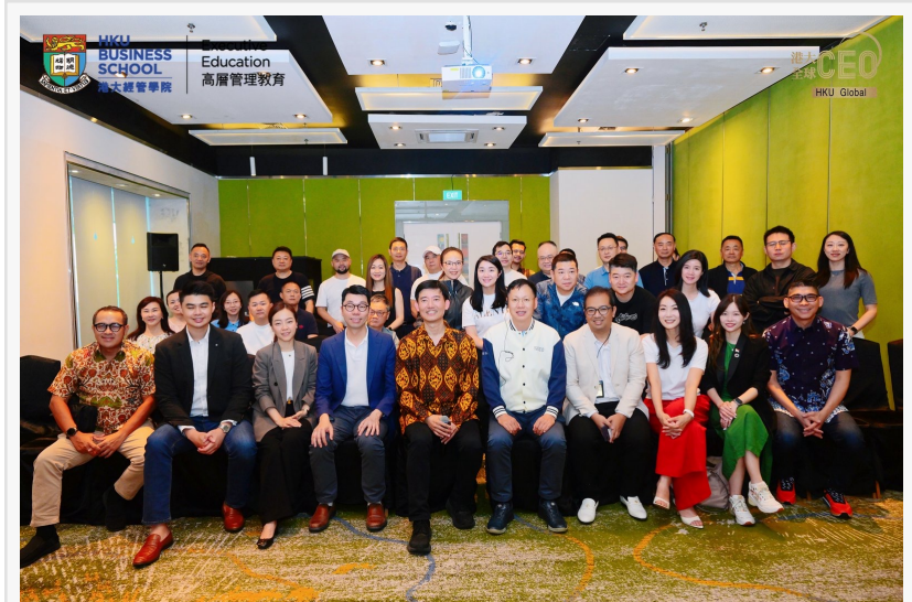
Group photo at the Indonesia Investment Outlook 2025, themed "Fostering Sustainable Growth through Strategic Hong Kong-Indonesia Collaboration."

JAKARTA, JAKARTA, INDONESIA, April 30, 2025 /EINPresswire.com/ -- The Indonesia Investment Outlook 2025: Hong Kong-Indonesia Partnership for Sustainable Growth is a strategic forum that brings together leading Hong Kong and China listed companies and key stakeholders in Indonesia. This event aims to drive sustainable economic growth through mutually beneficial partnerships between two dynamic markets in Asia: Hong Kong and Indonesia.