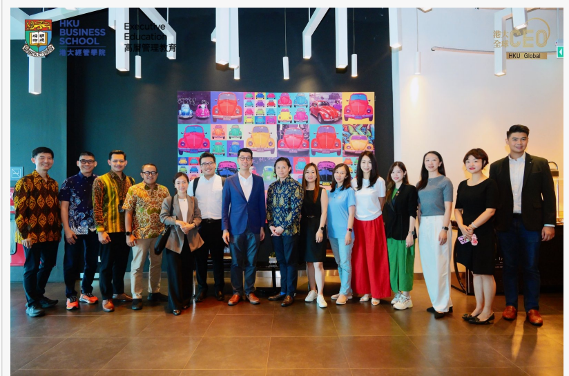
Group photo at the Indonesia Investment Outlook 2025, themed "Fostering Sustainable Growth through Strategic Hong Kong-Indonesia Collaboration."

Through this event, it is hoped that long-term cooperation will be fostered, driving an increase in