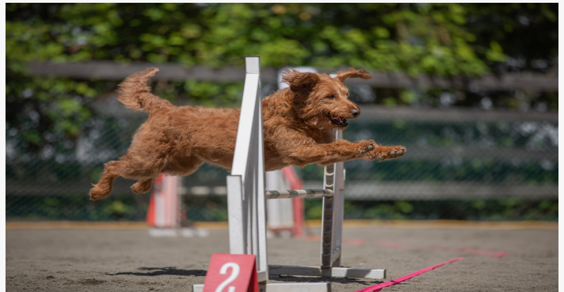
Trained Labradoodles Available