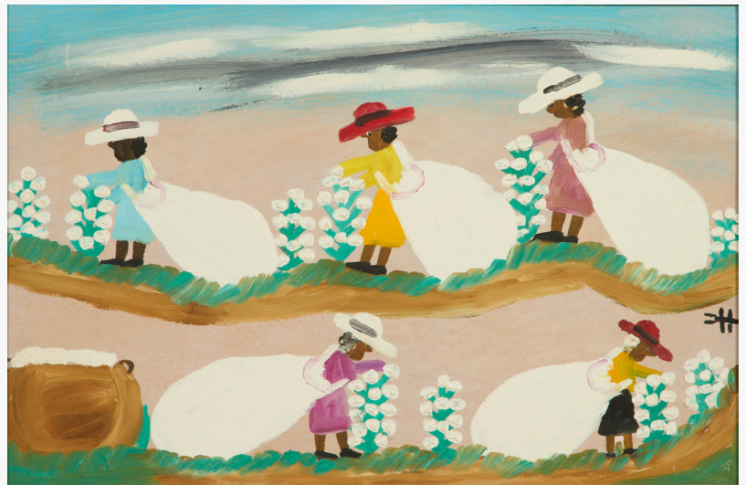
Oil on canvas board painting by the renowned Louisiana folk artist Clementine Hunter (1887-1988), titled Picking Cotton, a fine representation of her work. Estimate: $4,000-$8,000