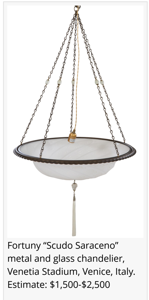
Fortuny "Scudo Saraceno" metal and glass chandelier, Venetia Stadium, Venice, Italy. Estimate: $1,500-$2,500

Crescent City Auction Gallery is always seeking quality consignments for future auctions. To consign a single item, an estate or a collection, you can call them at (504) 529-5057; or you can send an e-mail to info@crescentcityauctiongallery.com . All phone calls and e-mails are confidential.