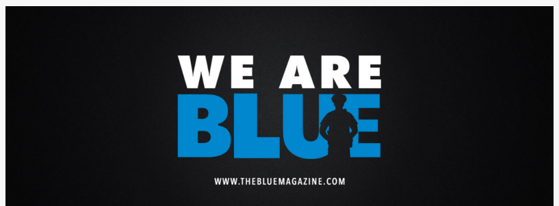
The Blue Magazine