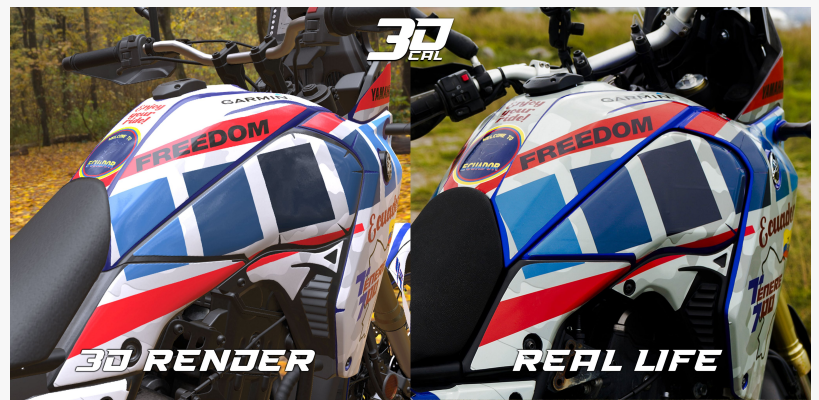
3DCal.com's 3D render technology is difficult to tell from a real-life photo

Riders are invited to design and order their custom protective decal sets for the KTM 890 Adventure R and Husqvarna 701 Enduro today at 3DCal.com.