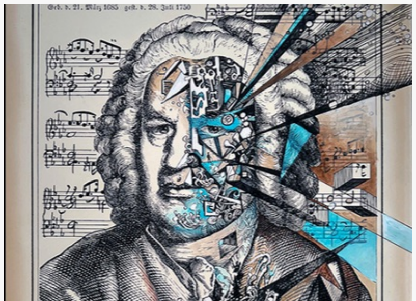
Verdi, Music of the Spheres (mixed media on paper, by Artem Mirolevich) (Photo Credit: Artem Mirolevich)