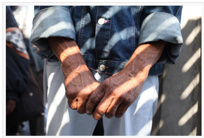
Gestures of Love is a striking body of work that explores love in its many forms

This press release can be viewed online at: https://www.einpresswire.com/article/808199368 EIN Presswire's priority is source transparency. We do not allow opaque clients, and our editors try to be careful about weeding out false and misleading content. As a user, if you see something we have missed, please do bring it to our attention. Your help is welcome. EIN Presswire, Everyone's Internet News Presswire™, tries to define some of the boundaries that are reasonable in today's world. Please see our Editorial Guidelines for more information. © 1995-2025 Newsmatics Inc. All Right Reserved.