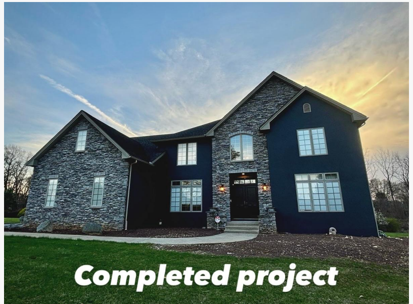
Completed stucco renovation project in Bethlehem, PA