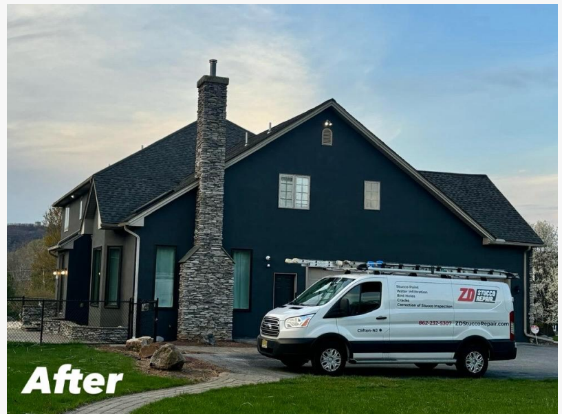
After image of stucco renovation project in Bethlehem, PA

This press release can be viewed online at: https://www.einpresswire.com/article/808209677