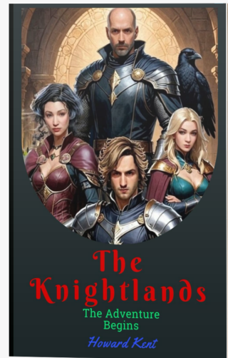
The Knightlands: The Great Commission

These five novels dive into true crime, mythic adventure, and psychological battlefields, revealing the authors' varied inspirations—from courtroom realism to childhood fantasy games. Each story carries a deep engagement with justice, imagination, and the spaces where reality and fiction blur.