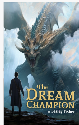
The Dream Champion