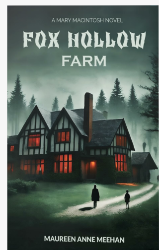
Fox Hollow Farm