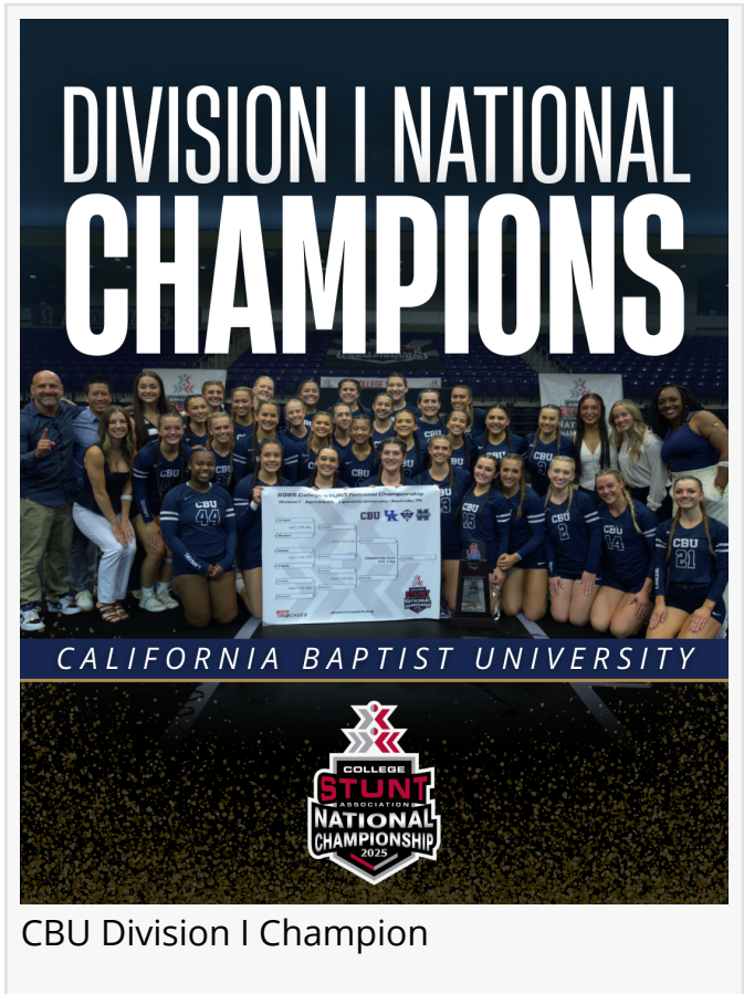
CBU Division I Champion