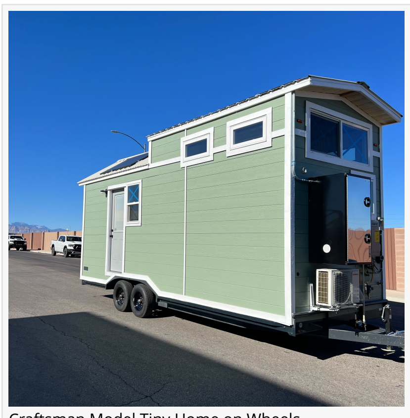
Craftsman Model Tiny Home on Wheels

LAS VEGAS, NV, UNITED STATES, May 1, 2025 /EINPresswire.com/ -- In the state of California, there are numerous jurisdictions that have approved moveable tiny homes as a legal Accessory Dwelling Unit (ADU) when placed in the backyard of an existing residential home. The permitting process is fairly streamlined, with minimal requirements for the tiny home placement including a requirement that the tiny home builder is ANSI certified by an approved thirdparty company. <u>Tiny Homes on Wheels</u> are inexpensive and can be manufactured quickly, allowing the homeowner to add the tiny home to their property in just a few months. Other states have recognized this option and are in the process of approving these homes for installation