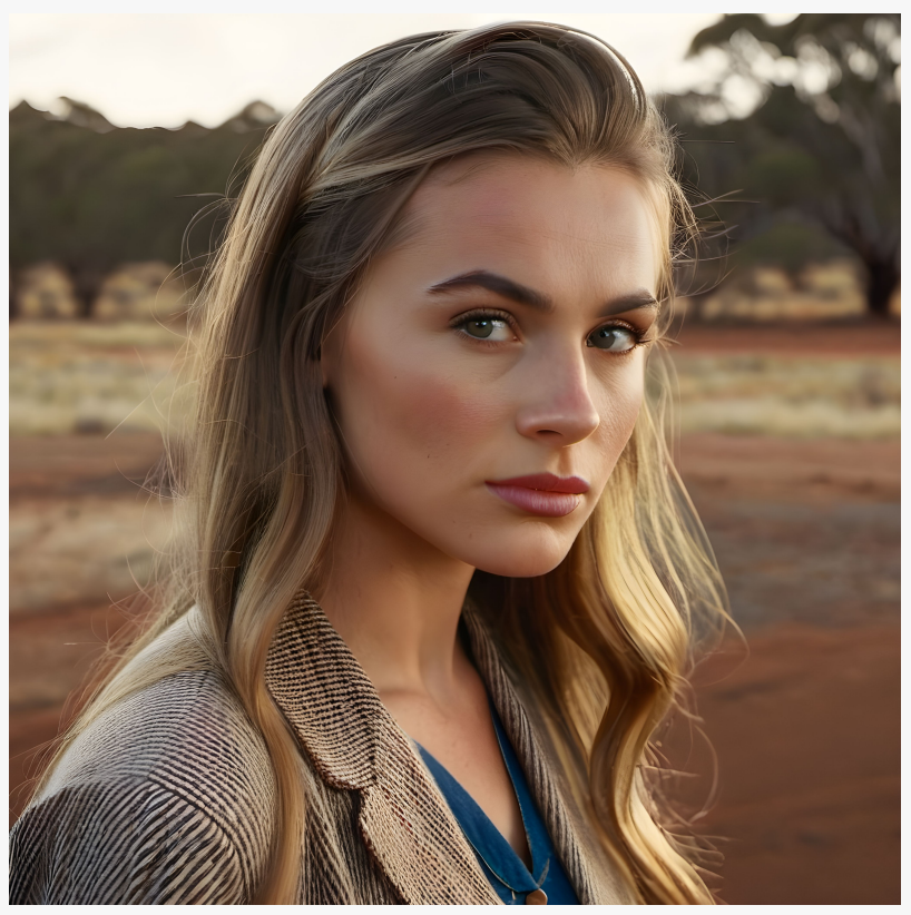
Amanda, a spirited young woman whose hunger for adventure quickly turns into a fight for understanding, belonging, and survival. When she stumbles upon a dangerous secret buried deep in the Outback,