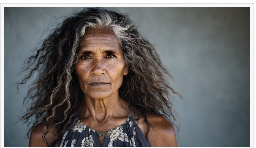
At the heart of the story is Ngarra, a revered Elder of the Munarrakalai people. As the bearer of ancestral knowledge, sacred law, and spiritual balance, Ngarra is both guardian and guide.

ADELAIDE, SA, AUSTRALIA, May 1, 2025 /EINPresswire.com/ --This Mother's Day, honour the wisdom, resilience, and bravery of women across generations with <u>Outback</u> <u>Odyssey</u>, the critically acclaimed historical fiction novel by Paul Rushworth-Brown, now nominated for a major literary award. Set against the breathtaking yet brutal backdrop of 19th-century Australia, this sweeping saga shines a powerful light on the women who guide, endure, and shape