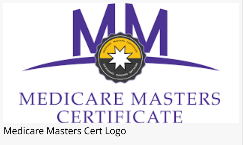
Medicare Masters Cert Logo