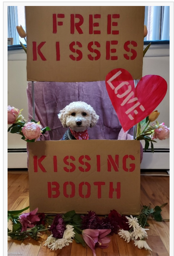
Harvey freely gives kisses to all