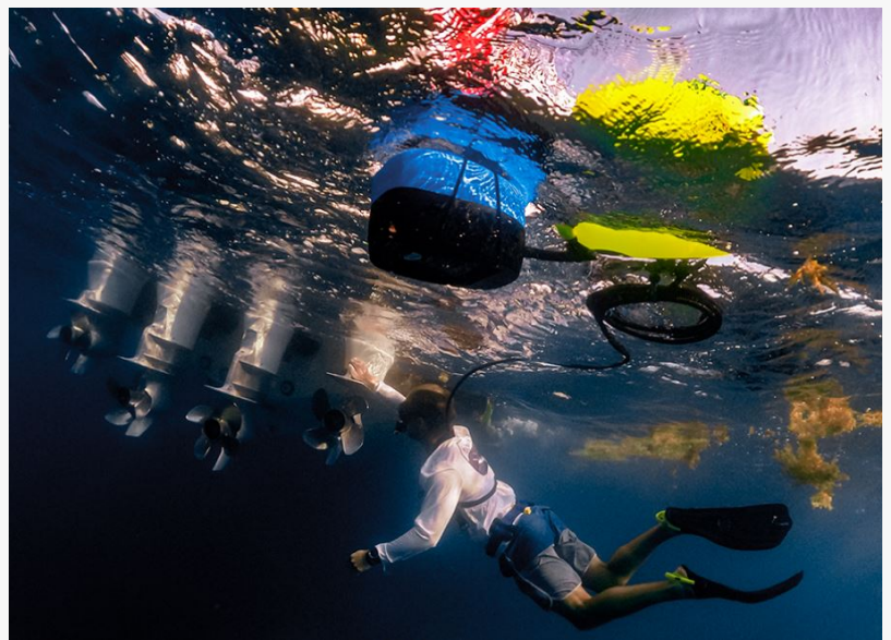
BLU3's Nomad & Nomad Mini are the perfect tools to use under your boat!

Catalina Crew is Marina del Rey's choice for marine services, stylish coastal clothing, boat rentals and more. You can learn more about Catalina Crew at catalinacrew.com .