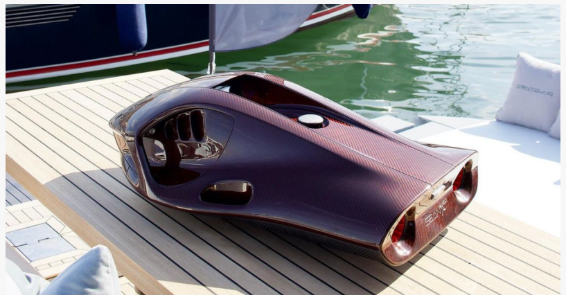
The SeaNXT Elite in striking red—an all-carbon fiber masterpiece designed for performance and luxury.

In partnership with Catalina Crew, BLU3 and SeaNXT will be exhibiting on Dock Linda, where attendees can get a firsthand look at the SeaNXT Elite water scooter and BLU3's cutting-edge dive systems, including Nomad and Nomad Mini. For anyone interested in multi-diver systems, BLU3 is a sister company of Brownie's Third Lung which released its innovative 3-diver Sea Lion lithium ion dive system in 2018.