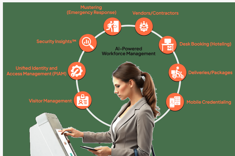
Splan's extensive offerings allows organizations to buy only what they need

enable organizations to streamline operations, enhance security, and improve compliance. With a focus on innovation, Splan delivers scalable and flexible solutions tailored to meet the unique needs of enterprises in various industries, including healthcare, education, and government. For more information, visit <a href="https://www.splan.com">www.splan.com</a>