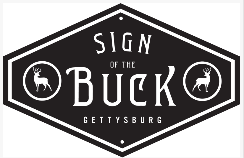
Sign of the Buck

Misfit Interactive is a full-service digital agency based in Gettysburg, PA, specializing in web design, SEO, social media marketing, branding, and more. With a passion for helping small businesses thrive online, Misfit Interactive combines creativity with strategic thinking to help