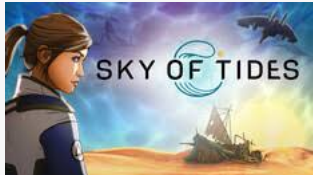
Lofty Skys' Narrative Sci-Fi Fantasy RPG "Sky of Tides"

Little Buffalo Studios (Booth #17105) is revealing its debut title – a crafting and survival PC adventure that features a mysterious talking campfire that holds many secrets and relaxed yet deep gameplay. Created by a veteran team that includes Red River Metis, Anishinaabe, and Mohawk creators, Akiwan: Survival is inspired by ten thousand years of indigenous survival knowledge and the true ingenuity of the crafts and techniques that kept indigenous peoples alive for thousands of years. Premiering at PAX East, more details on the game and a hands-on demo will be available at the show, and a chance to speak with the developer.