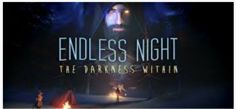
Little Guys Games' psychological Metroidvania "Endless Nights: The Darkness Within"

Available for hands-on demos, these titles range from an unannounced survival game inspired by Indigenous stories to a narrative-rich sci-fi fantasy "anti-RPG" RPG to a psychological action-adventure title, and a multicultural artistic VR experience. Press and creators attending PAX East can book appointments to see the games and talk to the developers here (link).