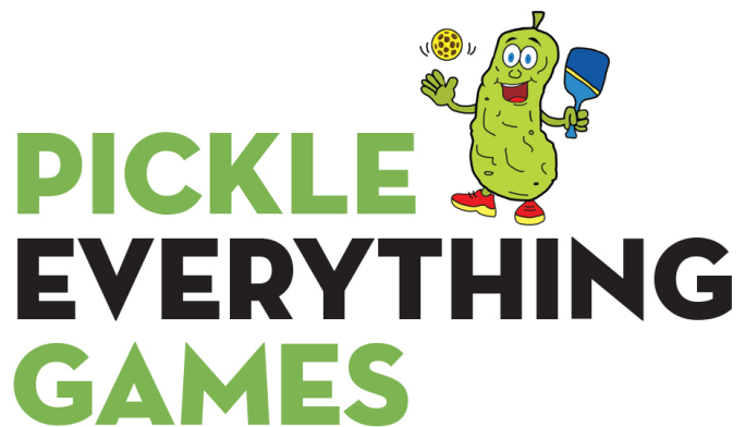
Pickle Everything Games Logo

This press release can be viewed online at: https://www.einpresswire.com/article/808889486 EIN Presswire's priority is source transparency. We do not allow opaque clients, and our editors try to be careful about weeding out false and misleading content. As a user, if you see something we have missed, please do bring it to our attention. Your help is welcome. EIN Presswire, Everyone's Internet News Presswire™, tries to define some of the boundaries that are reasonable in today's world. Please see our Editorial Guidelines for more information. © 1995-2025 Newsmatics Inc. All Right Reserved.