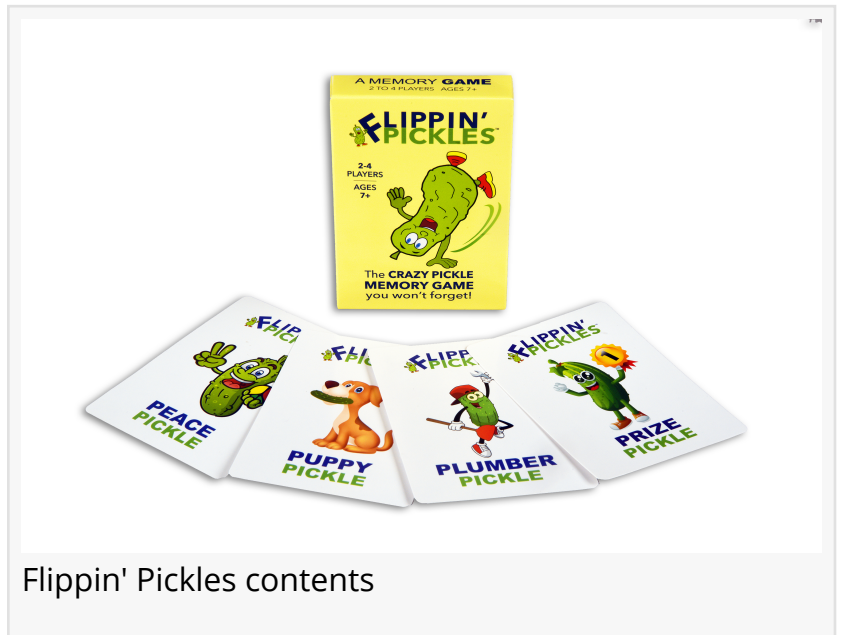
Flippin' Pickles contents

Bursting with briny energy and laugh-out-loud action, Flippin' Pickles (MSRP $9.99 for 2-4 players ages 7+) is an easy-to-learn, snappy memory game marinated in challenges for players to boldly flip and match their way to earn the title of Top Pickle!