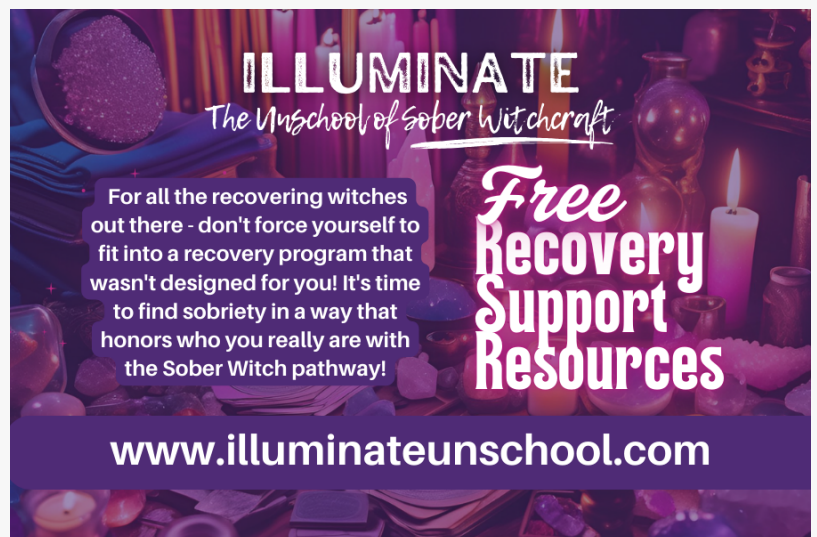
Free Recovery Support