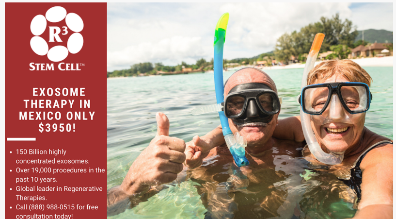
R3 new logo