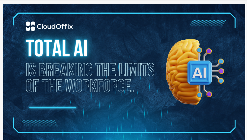
CloudOffix Total AI