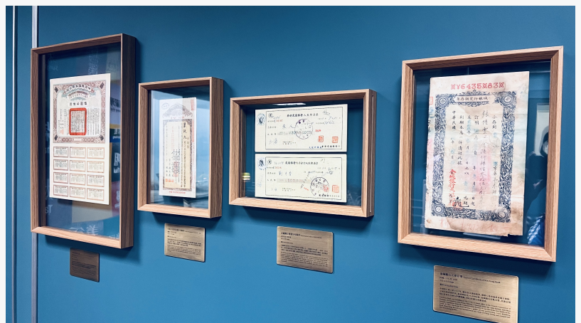
Some of Stanley HUI's financial collections on display