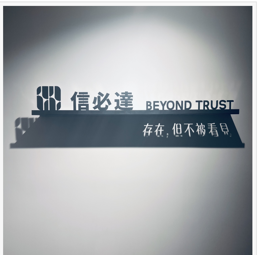
Special designed logo wall of Beyond Trust Company Limited