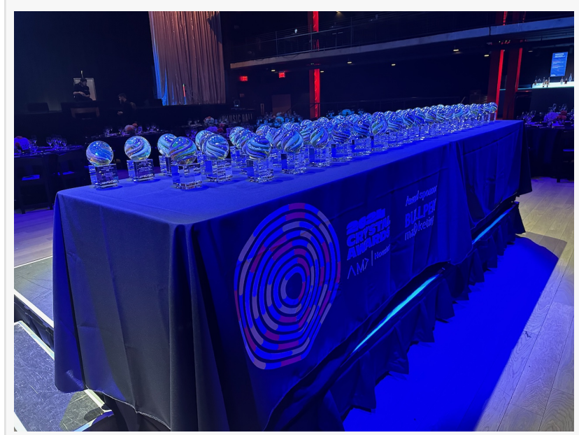
AMA Trophies Stage is Set

This global footprint enables Centric to effectively support energy companies with tailored digital solutions that align with the complex communication demands of the sector. With award-winning expertise in enterprise web design, SEO, and marketing automation, Centric helps businesses streamline operations, elevate engagement, and scale with confidence.