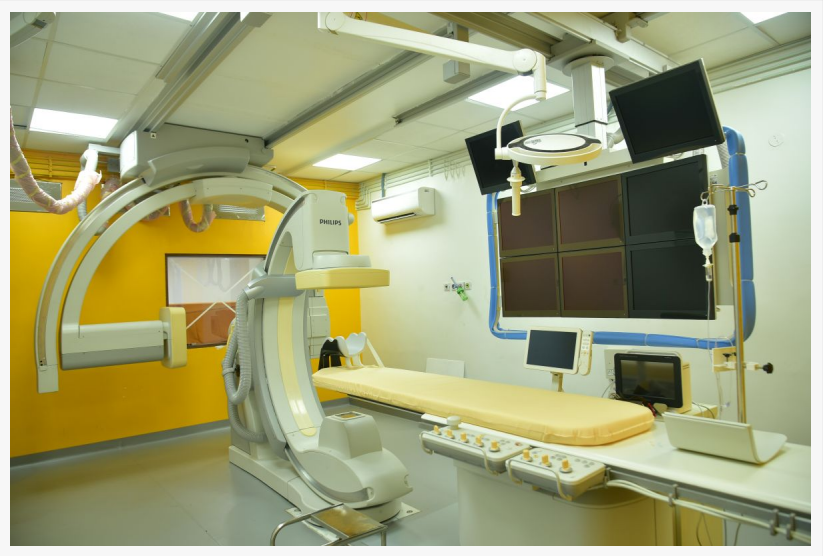
The advanced biplane cath lab at Dr. Rao's Hospital, designed for precision neurovascular procedures and minimally invasive surgeries, first in Andhra Pradesh and Telangana in India.