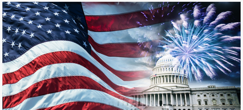
E2 Visa to Green Card