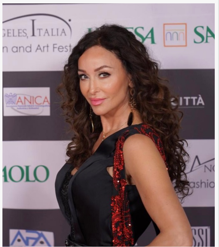
Sofia Milos wears Tess Mann Atelier at the 2025 Los Angeles Italia Film Festival at the Chinese Theatre.

Please note: The DPA Gift Lounge event is its own entity and not affiliated with the Los Angeles