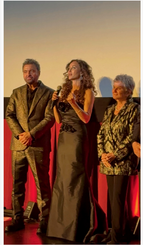
Sofia Milos wears Tess Mann Atelier at the 2025 Los Angeles Italia Film Festival at the Chinese Theatre.

This press release can be viewed online at: https://www.einpresswire.com/article/809410407