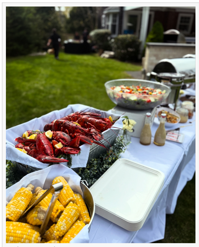
Lobster Bake Event

This press release can be viewed online at: https://www.einpresswire.com/article/809481628 EIN Presswire's priority is source transparency. We do not allow opaque clients, and our editors