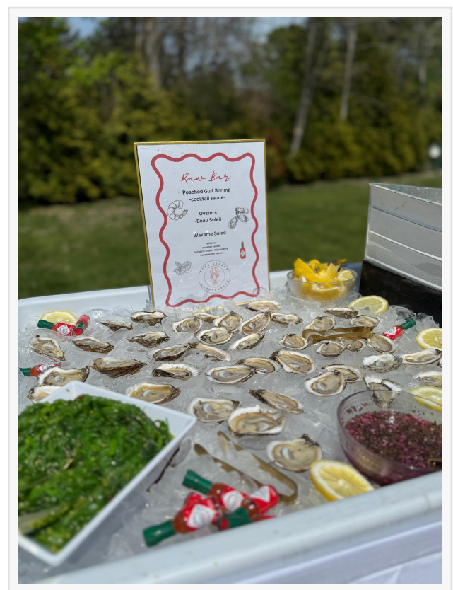
Raw Bar Offerings

At Long Island Lobster Bake, the focus is on creating memorable experiences through fresh, locally sourced ingredients and custom-designed menus. The company's signature lobster bakes feature sweet Maine lobsters, plump clams, mussels, and seasoned sides like roasted potatoes, sweet corn,