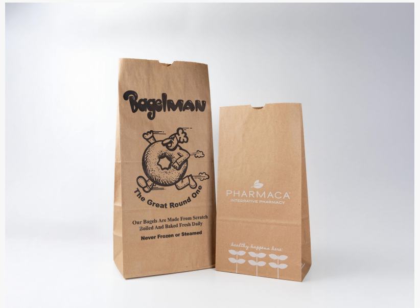
Custom Bakery Bags