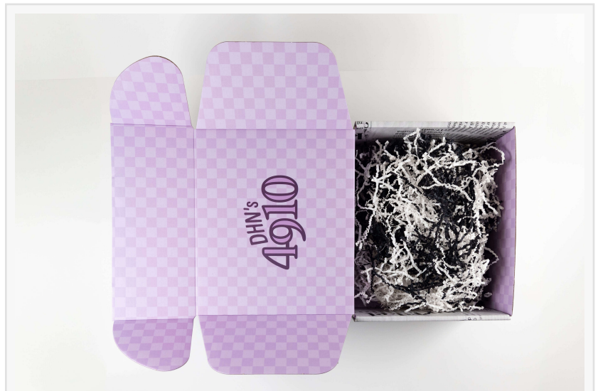
Mailer Boxes with Multi-color Print

With nearly five decades of industry expertise, Plus Packaging is a trusted provider of innovative, high-quality custom packaging solutions designed to elevate brands and exceed customer expectations. Specializing in packaging engineering, sustainable practices, and tailored industry