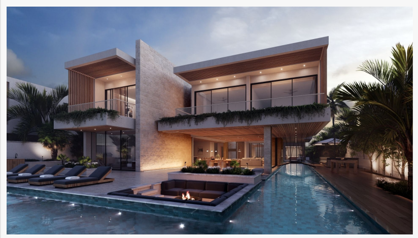
Navah Turks & Caicos