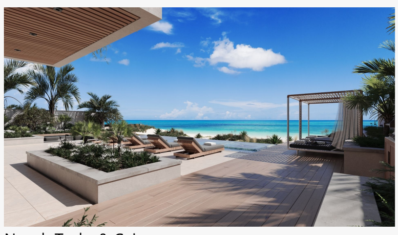
Navah Turks & Caicos

Navah is not just a property; it's a lifestyle. Residents and guests will enjoy a diverse array of amenities, including: