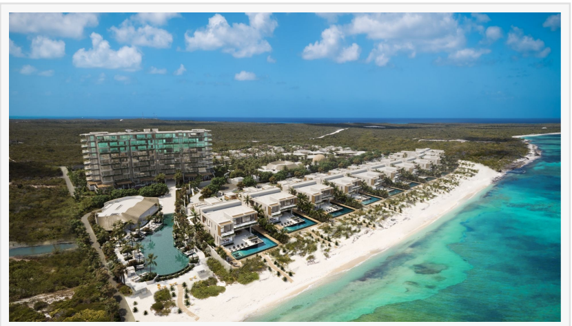
Navah Turks & Caicos Masterplan