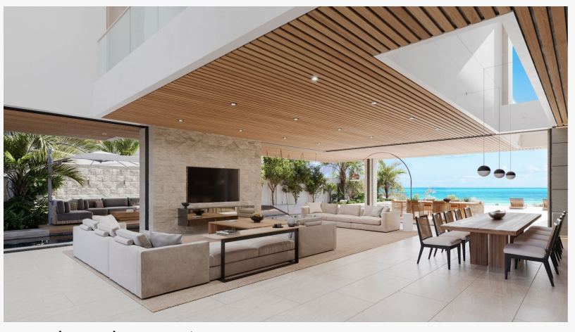
Navah Turks & Caicos

• Wellness-Focused Design: The spa at Navah will offer curated therapies, guided meditation, and sound baths, ensuring every moment is restorative.