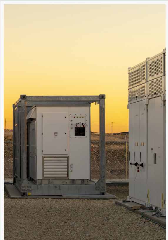
The inverter is one of the most common points of failure in an energy storage system.

"Storage operators consistently tell us one of their biggest headaches is staying on top of PCS