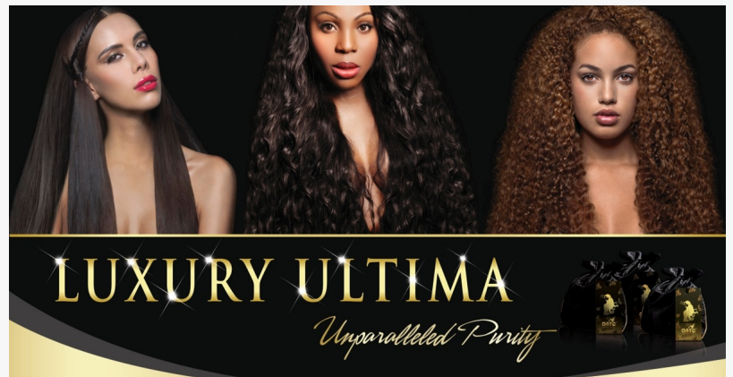
ONYC Hair Luxury Ultima Banner