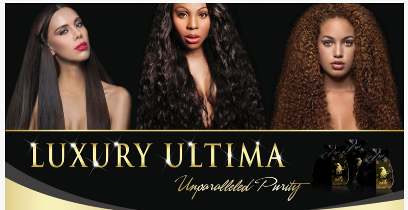
ONYC Hair Luxury Ultima Banner