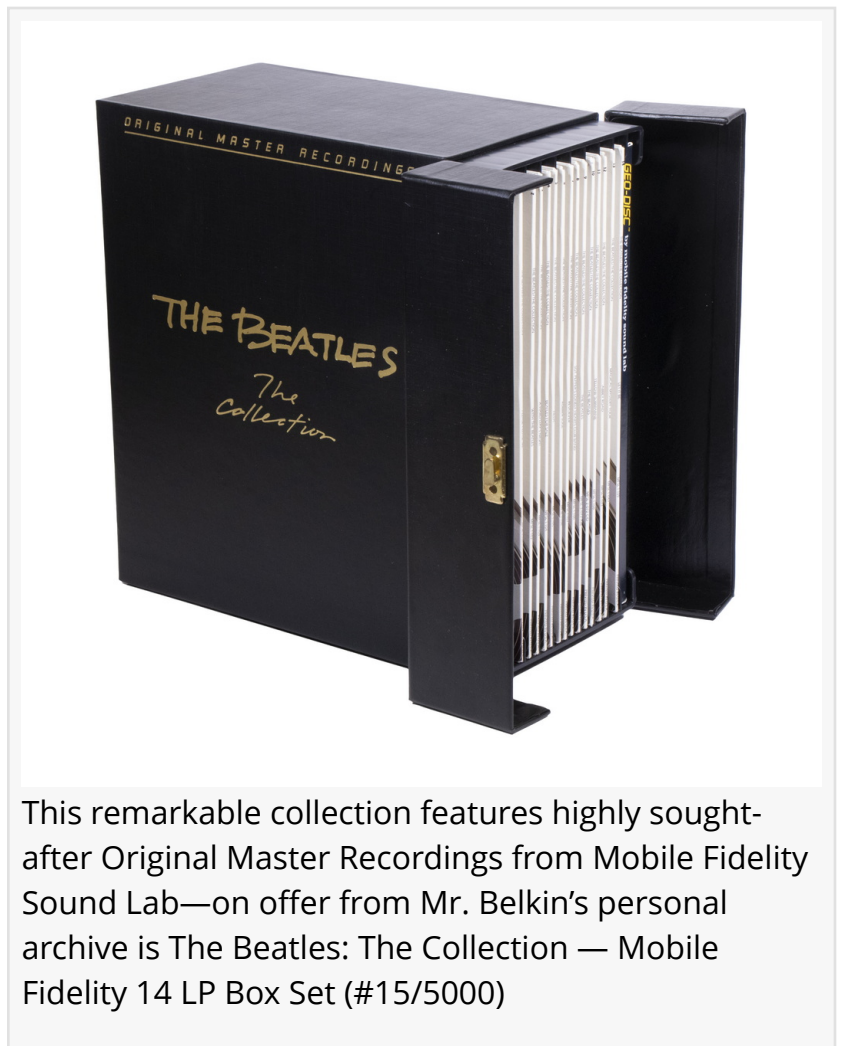
This remarkable collection features highly sought-after Original Master Recordings from Mobile Fidelity Sound Lab—on offer from Mr. Belkin's personal archive is The Beatles: The Collection — Mobile Fidelity 14 LP Box Set (#15/5000)

Select highlights are available now at www.thomastonauction.com , with the full collection on public view at Thomaston Place Auction Galleries in the lead-up to the June sale.