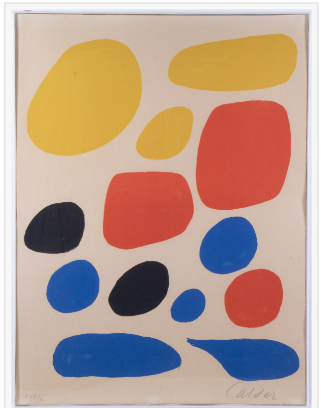
A highlight of the contemporary art includes an Artist Proof edition of only 50 by Alexander Calder.

This press release can be viewed online at: https://www.einpresswire.com/article/809718763