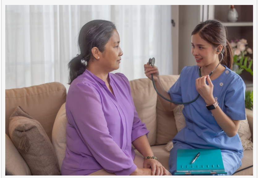
Basic Healthcare Aide assessing patient