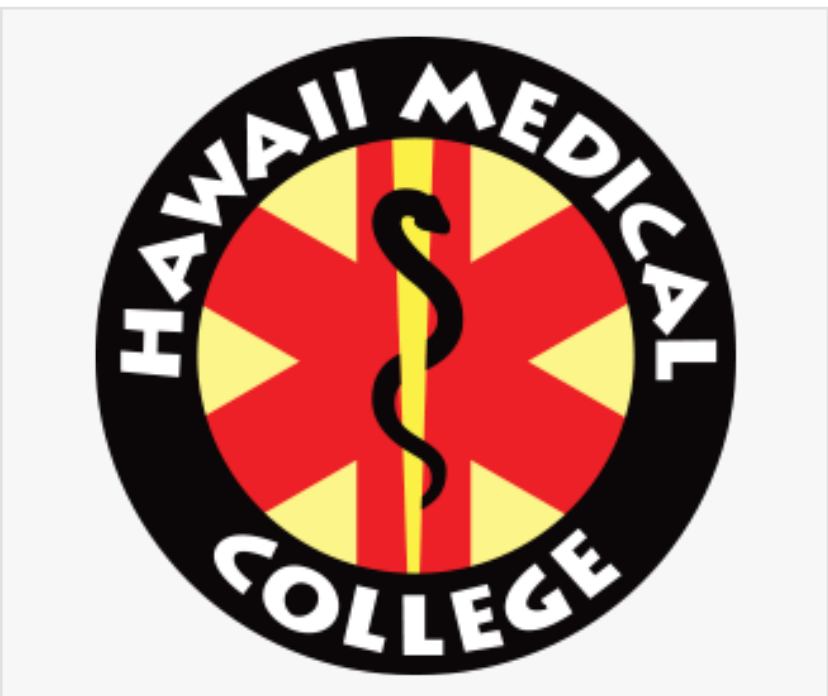
Hawaii Medical College Offers Programs for Careers in Healthcare.

The Basic Nurse Aide Program at Hawaii Medical College prepares students for the roles of Nurse Aide, Nursing Assistant, and Home Health Aide. The program covers introducing, practicing and assessment of skills: Vital Signs, patient/resident assistance with Activities of Daily Living (ADL's), or full care of patients/residents in the hospital bed, wheelchair/chair, along with professional communication to ensure patient/resident safety in a long-term care facility, independent living and home (home health). Through a combination of lectures, working in the lab, and experience at either HMC Home Care or HMC Care Home, students will gain the