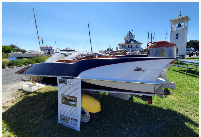
1957 Switzer Craft

ACBS-Chesapeake Bay is one of the 57 U.S. & Canadian chapters of The Antique and Classic Boat Society, Inc. and has more than 200 members enrolled representing more than six states. The Chesapeake Bay Chapter welcomes individuals and families who share a common interest in antique and classic boats. It hosts numerous member activities and sponsors the Antique and Classic Boat Festival in St. Michaels, Md., every June so members can meet, share experiences, exchange information and expand their knowledge of historic, antique and classic boats – both wood and fiberglass. Its objective is to generate enthusiasm for all aspects of members' interest in sustaining, maintaining and preserving antique and classic boats. To learn more about ACBS-Chesapeake Bay, visit the website and follow the chapter on Facebook.