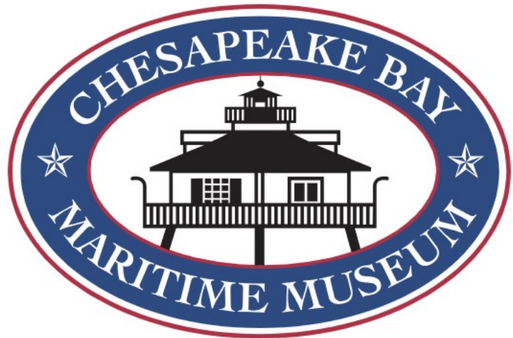
Chesapeake Bay Maritime Museum