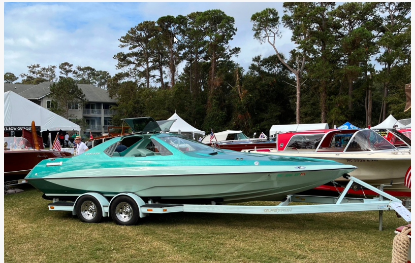
A 1980 Glastron Scimitar