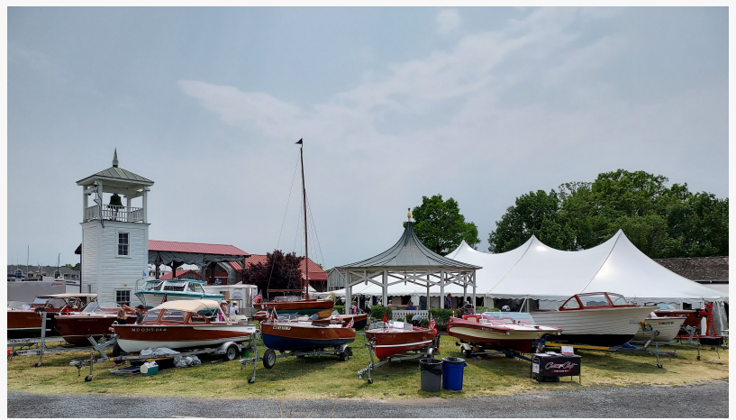
St Michael's Antique Boat Show

Businesses that wish to advertise in the program journal, distributed to thousands of festival-goers, may register online at chesapeakebayacbs.org/sponsorship-advertising-order-form