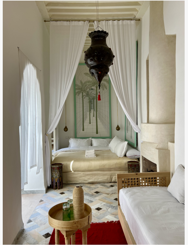
Bedroom 7 Riad Tizwa Marrakech Morocco.