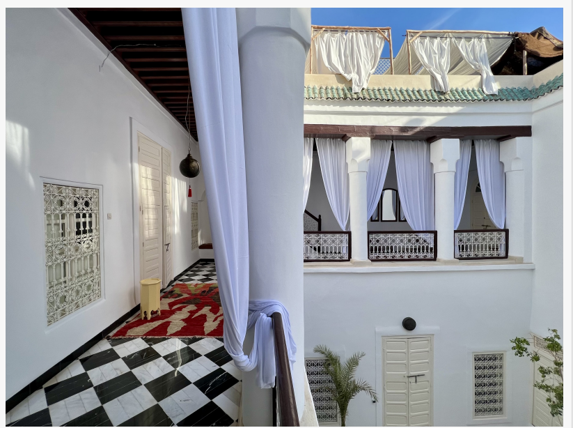
Riad Tizwa Marrakech environmental hotel

invited them to join the program. Other verified hotels include the Regent Hong Kong, Pullman Phuket Karon Beach Resort, and Zannier Bãi San Hô in Vietnam.