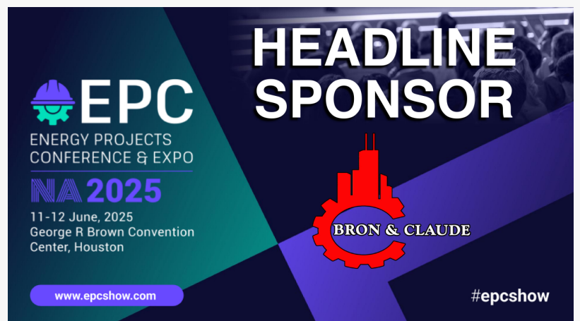
2025 EPC Show Houston Bron and Claude Headline Sponsor

“We are excited to join EPC Show 2025 as a Headline Sponsor,” said a spokesperson for Bron &