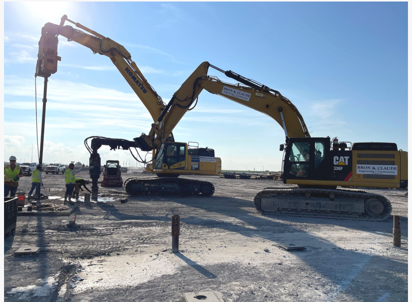
Bron and Claude Helical Piles Construction Site