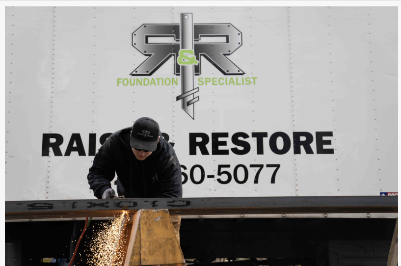
R&R Foundation Specialist | Employee Working | Seattle Foundation Repair

This Small Business Day, R&R Foundation encourages customers to remember the value of supporting businesses that are rooted in their community. By choosing local, you help ensure that businesses like R&R Foundation can continue to thrive, providing personalized service that truly cares about the people they serve!