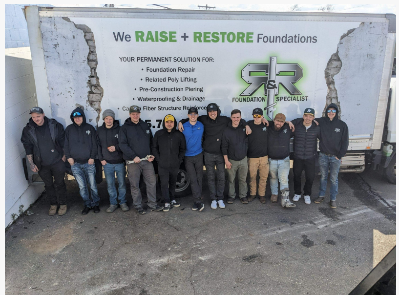
R&R Foundation Specialist Team Photo | Seattle Foundation Repair