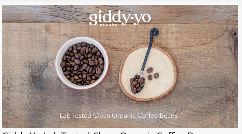
Giddy Yo Lab Tested Clean Organic Coffee Beans

Giddy Yo takes pride in its signature handcrafted organic dark chocolate, crafted from premium Criollo cacao