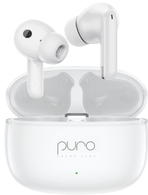
PuroQuiet Air True Wireless ANC Headphones

Limits audio to 85dB to help prevent noise-induced hearing loss.